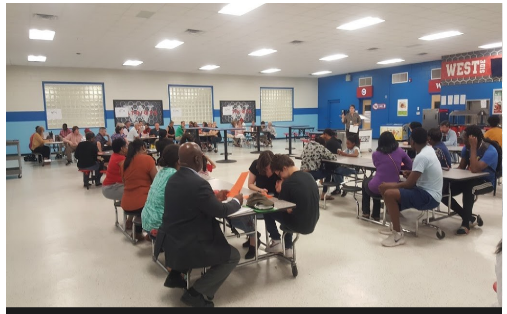
Parents listening to principal's greeting at a Title I end-of-year input /revision meeting