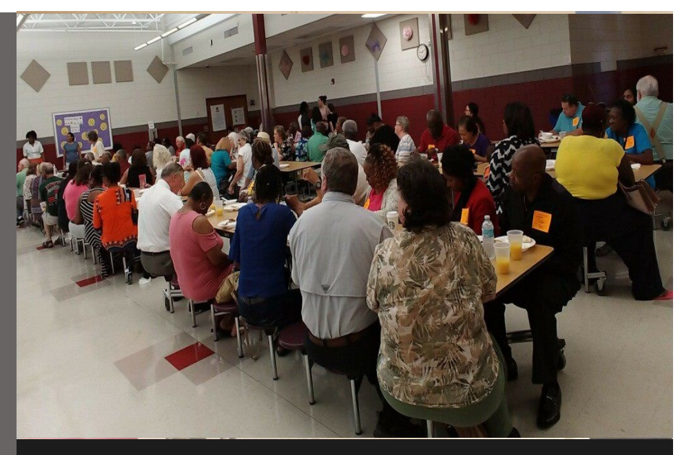
Parents receiving valuable information at a school's parent night

Additionally, the Title I department will provide training to principals so principals will understand parent and family engagement requirements and plan opportunities for family engagement activities and meetings for the remainder of the school year.